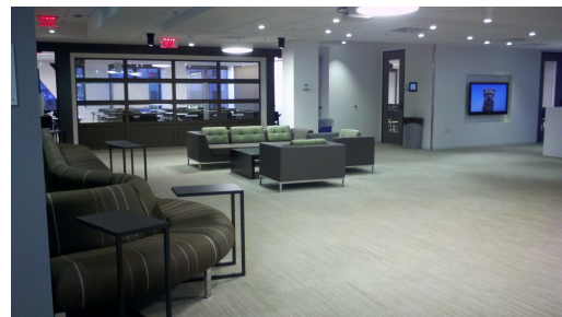
Fourth Floor Meeting Area