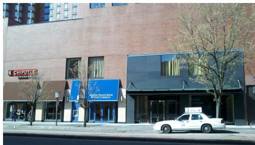
Street View of Boston Properties Entrance (for arrival after 5pm)