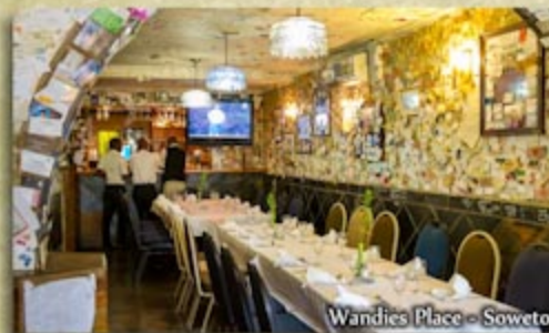
Wandies Place - Soweto