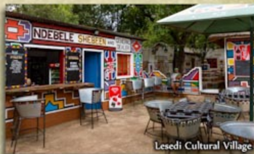
Lesedi Cultural Village