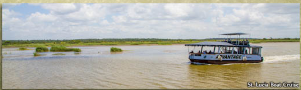
St. Lucia Boat Cruise