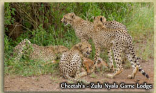
Cheetah's - Zulu Nyala Game Lodge