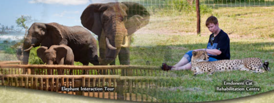
Elephant Interaction Tour