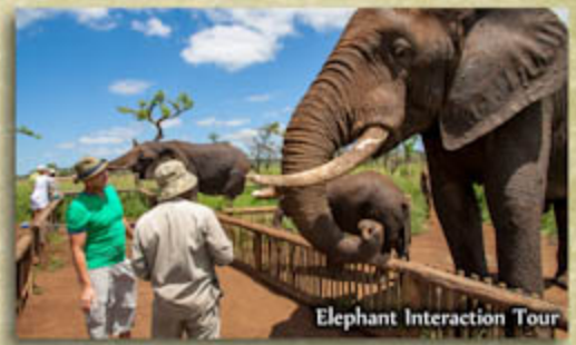
Elephant Interaction Tour