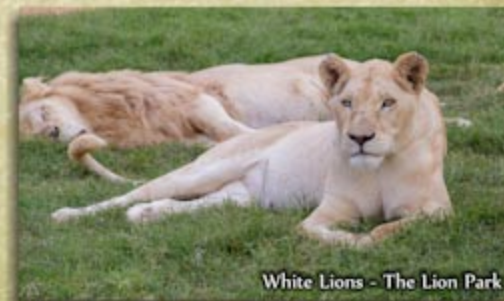
White Lions - The Lion Park