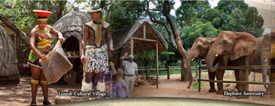
Luzedi Cultural Village