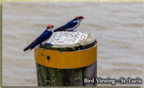
Bird Viewing - St. Lucia