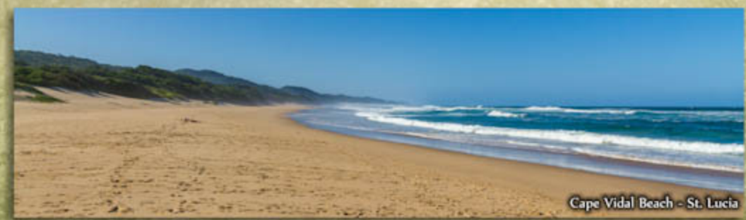
Cape Vidal Beach - St. Lucia